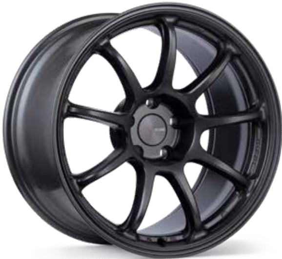
Matte Gunmetal (GM)