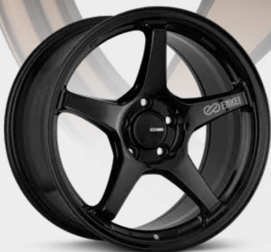
Gloss Black (BK)

The lightweight Enkei TS-5 is sure to be an instant classic in the tuning world. The TS-5 is the wheel that will have everyone admiring it at a loss for words because it just does everything right. It is remarkably simple and clean, relying on the tried and true 5-spokes and a lip formula, but the TS-5 gets the aesthetics just right. It is the golden ratio in wheel form. It screams motorsports and whispers class at the same time. It is just as much at home on track as it is on the street. With 17" and 18" sizing and widths up to 9.5", the TS-5 will suit a remarkable variety of sport sedans and coupes.