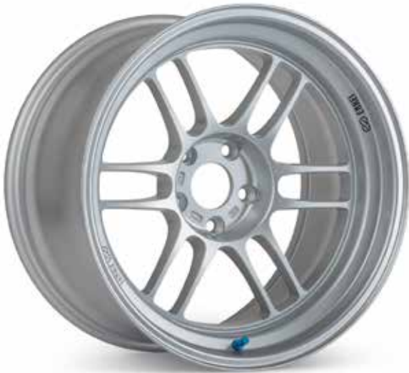
F1 Silver (SP)