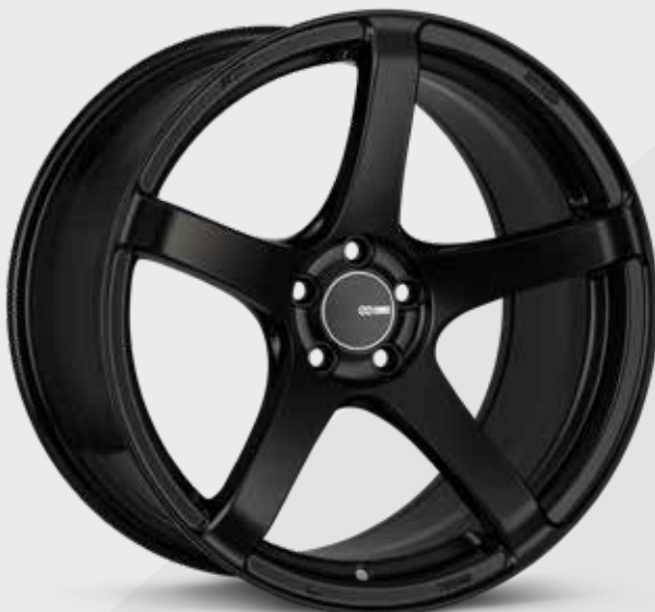
Matte Black (BK)