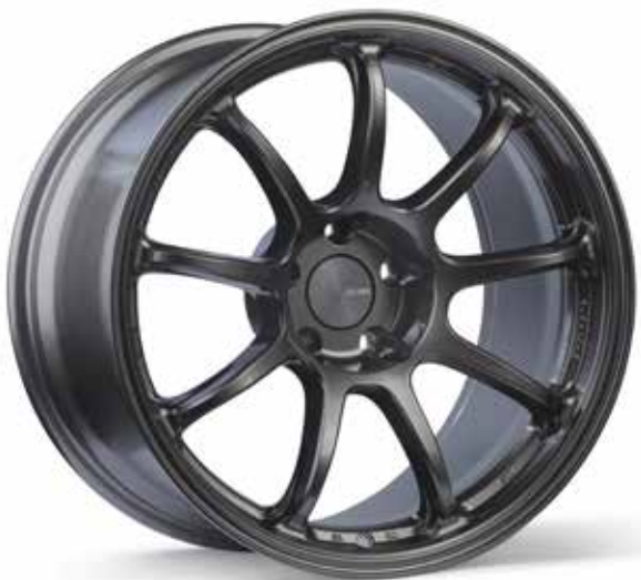
Dark Silver (DS)

The PF09 is the latest addition to Enkei's Racing Series lineup. Featuring 9 smartly contoured spokes designed to curve around big brakes found on modern sports cars, the PF09 is an excellent choice for track day enthusiasts and weekend autocrossers alike. The PF09 is available in sizes ranging from 16x7 to 18x10.5 and is available in Enkei's Dark Silver or Matte Gunmetal Finish. All PF09s feature Enkei's signature flat center cap.