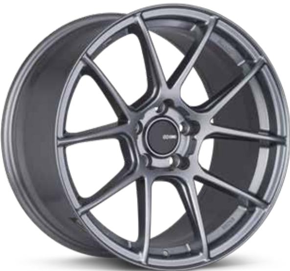
Storm Gray (GR)