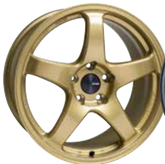
Gold (Special Order)