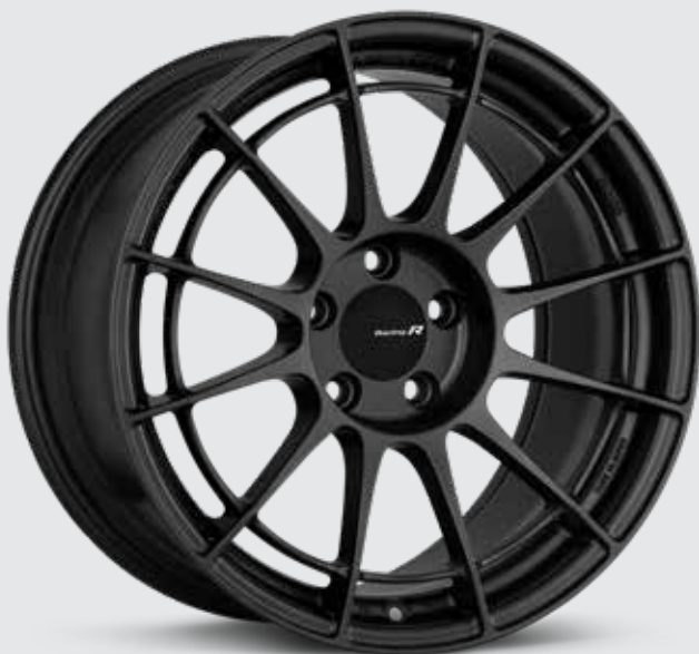
Matte Gunmetal (GM)