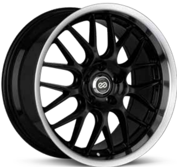
Black with Machined Lip