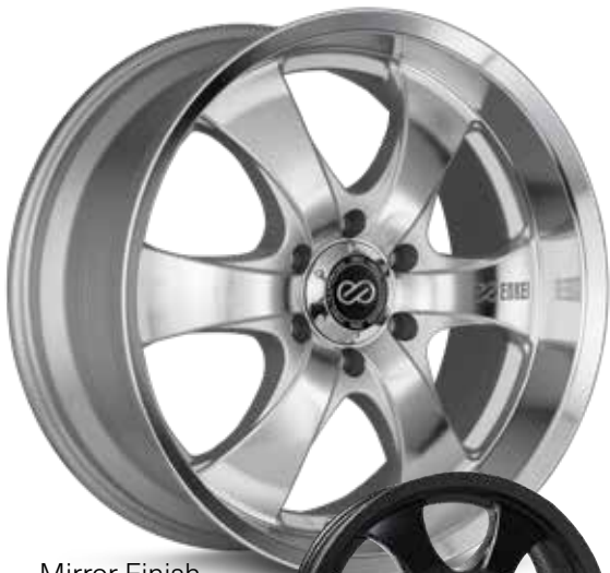
Mirror Finish (MF)