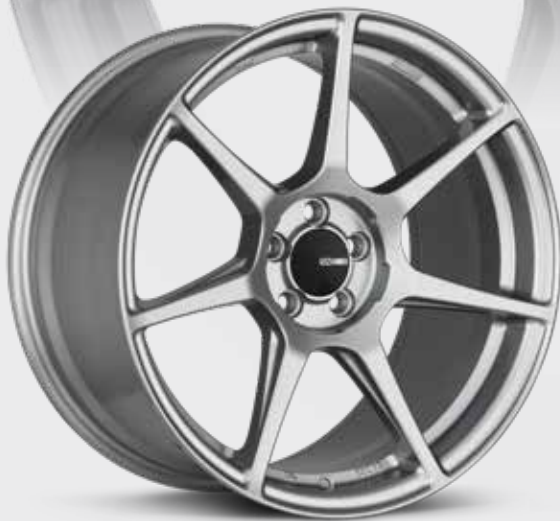
Storm Gray (GR)

Simplify and add lightness. That's the approach Enkei has taken with the TFR Tuning Series wheel. Seven perfectly contoured spokes start from a center with carefully placed cuts to save every ounce possible. The TFR is the wheel you can autocross with on the weekends and drive to work with during the week. It is truly versatile. The TFR is available in 17", 18", and 19" sizing in all new Copper, Storm Gray, and limited Gunmetal finishes. The wheel is finished off with Enkei's signature flat center cap.