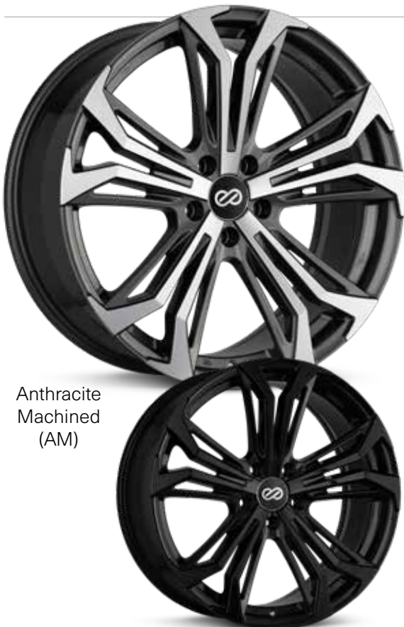
Anthracite Machined (AM)