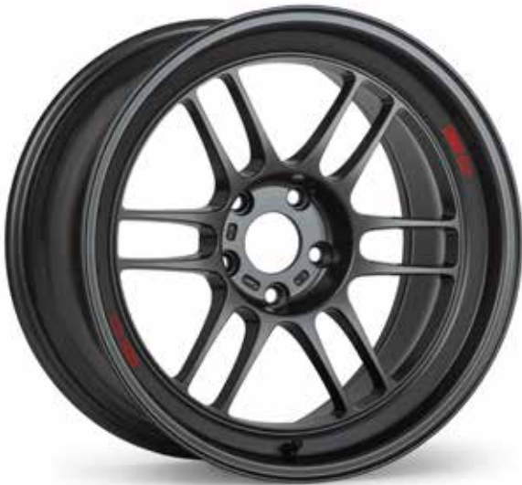
Dark Gunmetal (GM)

The RPF1RS is everything you love about the RPF1 with the addition of a deep face creating a large lip. The RPF1RS is made in Japan and has been in the works for years. We at Enkei wanted to make sure we created a “big lip” RPF1 that lived up to the strong structural quality you expect from us. It is available in low insets and even a negative inset for the 11” wide version.