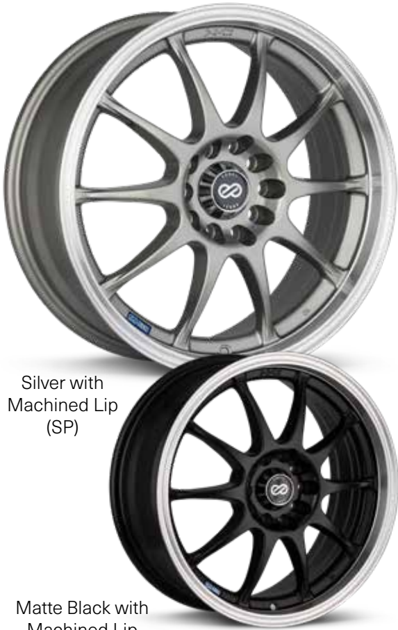
Silver with Machined Lip (SP)