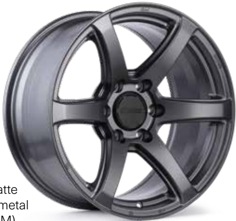
Matte Gunmetal (GM)

Introducing Enkei's Truck Series. While Enkei is most well known for its high-performance car wheels, it is proud to offer a range of wheels designed for trucks and SUV's as well. Enkei has applied its unrivaled engineering capabilities to come up with several designs that will stand up to the tough demands that truck and SUV drivers place on their wheels. Utilizing Enkei's world class manufacturing facilities and emphasizing function over flare, the Enkei truck series offers a great way for truck and SUV owners to add some styling to their vehicle, while maintaining the tough and rugged capabilities they count on from their wheels.