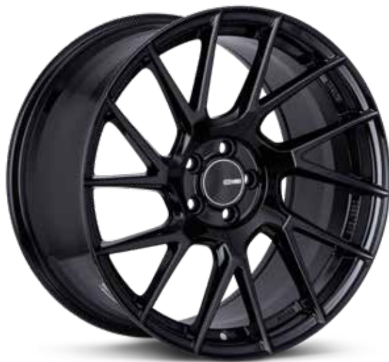
Gloss Black (BK)