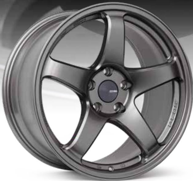
Dark Silver (DS)