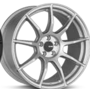
Matte Silver (SP)