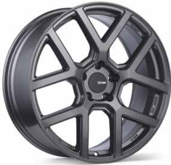
Gloss Gunmetal (GMH)