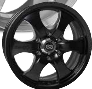
Matte Black (BK)