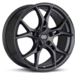
Gloss Anthracite (AP)

The Enkei Vulcan Performance wheel is the perfect choice for those wanting to add bold style to their sporty coupes, sedans, and crossovers. The Vulcan's unique split spoke design starts with pockets around the center that are not only a styling cue, but a design feature that also helps reduce the weight of the wheel.