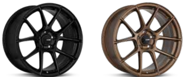
Gloss Black (BK)