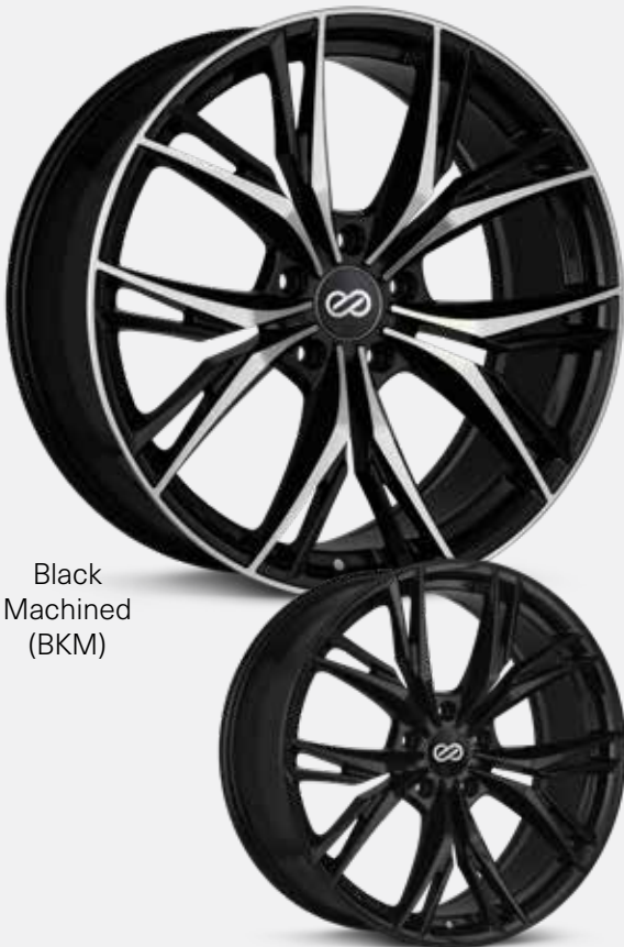
Black Machined (BKM)