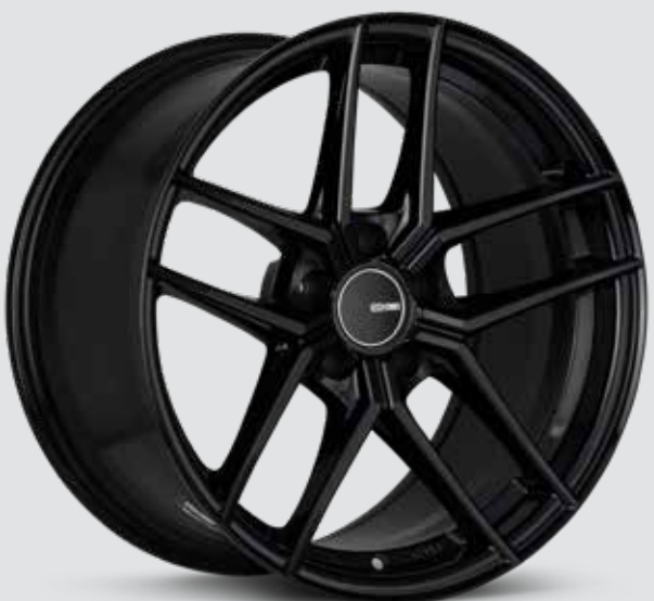
Gloss Black (BK)