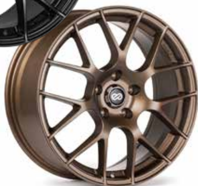
Matte Bronze (BP)