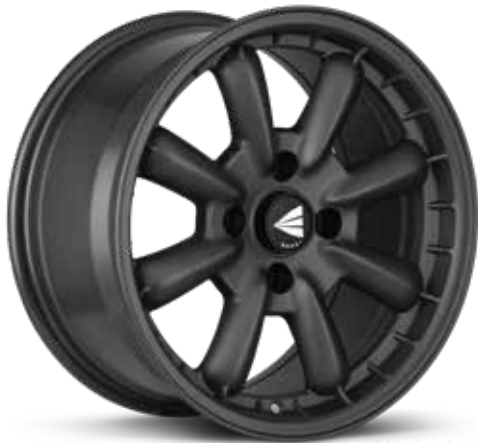
Matte Gunmetal (GM)