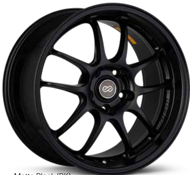
Matte Black (BK)