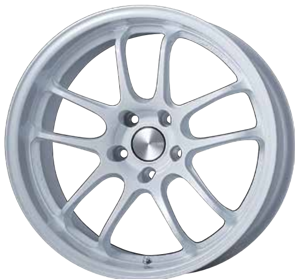
Pearl White (WP)