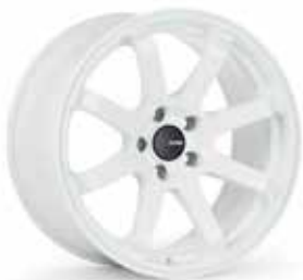
White - (WH - Special Order)