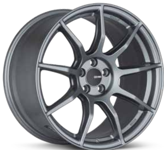
Platinum Gray (GR)