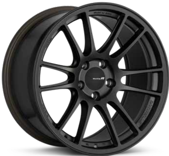
Matte Gunmetal (GM)