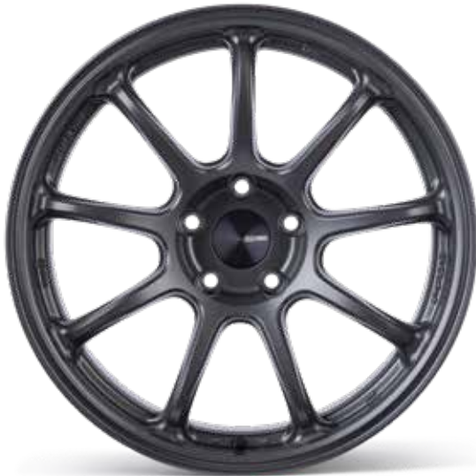
Matte Gunmetal / front angle (GM)