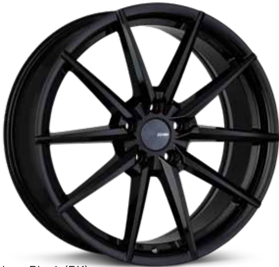
Gloss Black (BK)