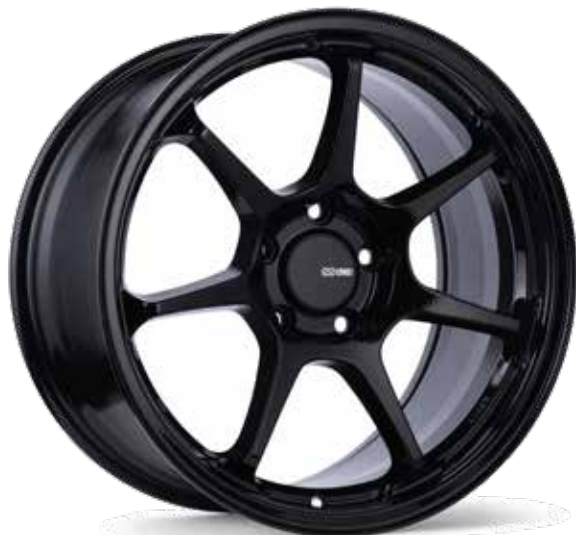
Gloss Black (BK)