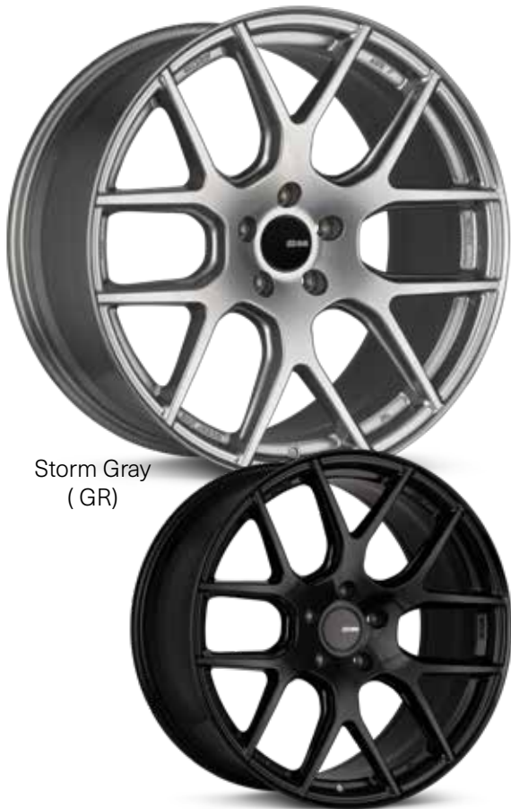
Storm Gray (GR)