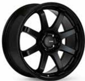
Gloss Black (BK)