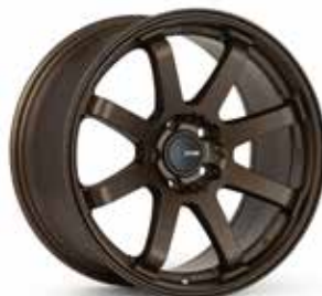
Matte Bronze (ZP) [non 5x114.3 fitments are special order only]