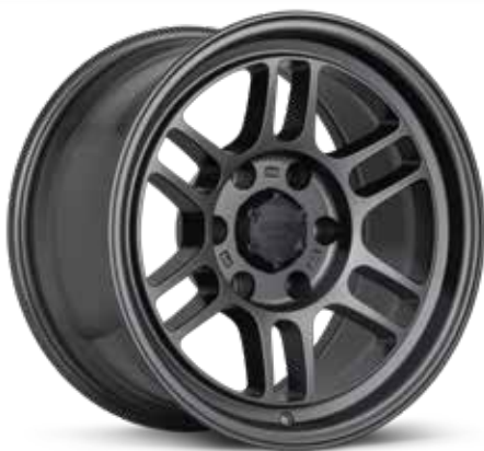
17x9 w/cap Matte Dark Gunmetal (GM)