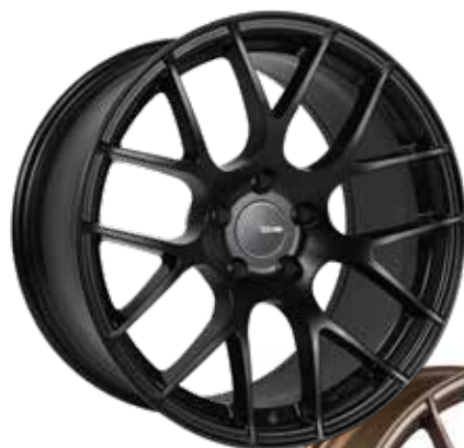
Matte Black (BK) (Shown with optional flat cap)