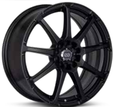
Matte Black (BK)