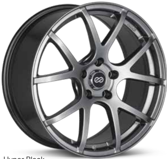
Hyper Black (HB)