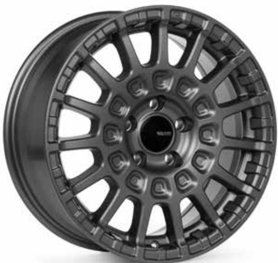
Matte Gunmetal (GM) (Special Order)