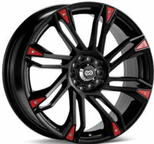
Matte Black with Red Trim (BK)