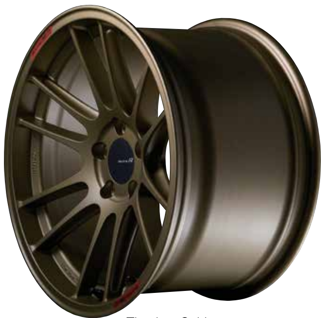
Titanium Gold (Limited Sizes / Special Order)