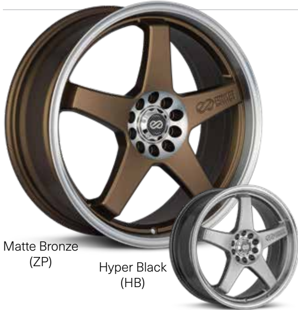
Matte Bronze (ZP)