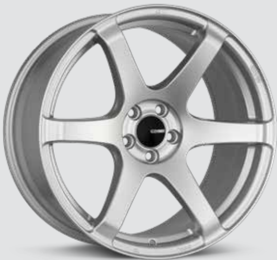
Matte Silver (SP)