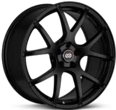
Matte Black (BK)