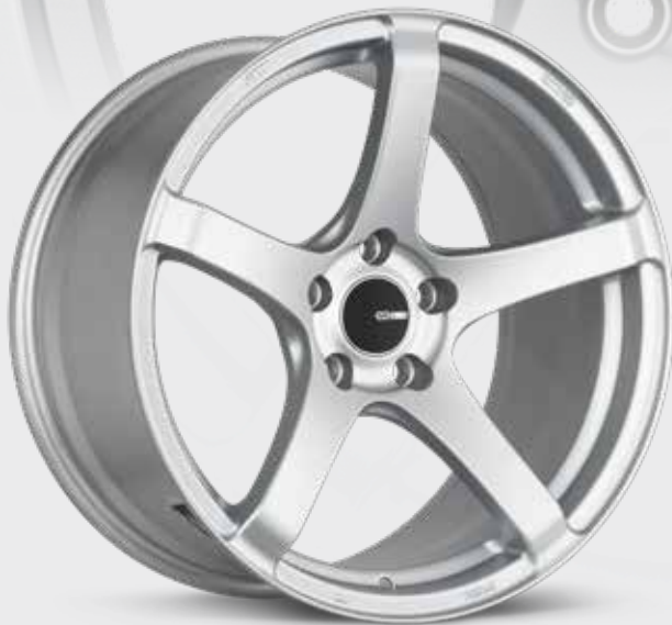
Matte Silver (SP)

The KOJIN takes the traditional 5-spoke design and adds just the right contours to give it an aggressive tuner look without being too loud about it. The KOJIN is built using Enkei's original MAT technology to achieve the ultimate in strength and light weight. The Enkei KOJIN is where art and science meet to create the next big step forward in wheels.