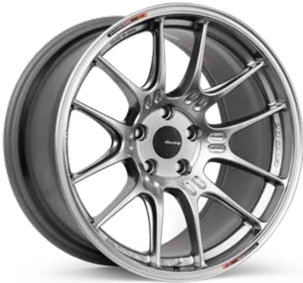
Hyper Silver (HS)