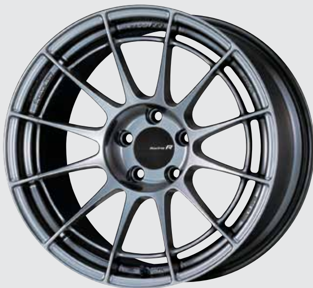
Hyper Silver (Limited Sizes / Special Order)

Another Enkei Racing legend has received an RR makeover with Enkei's latest MAT DURA II flow forming rim, the NT03RR. The wheel's iconic brace ring evenly distributes stresses on spokes to help rim rigidity even further, giving NT03RR superb cornering and steering response capabilities. Dynamic design with concave rear face offers a beautiful, yet powerful form to complete any true racing setup. The NT03RR is offered in sizes ranging from 17x7 all the way up to 18x11 with a variety of bolt patterns and concaveness profiles. Available in three different concave faces.