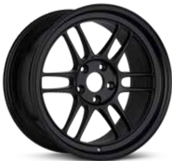
Black (BK) (Limited Sizes)