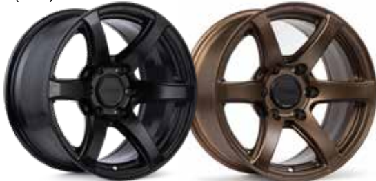
Matte Black (BK)