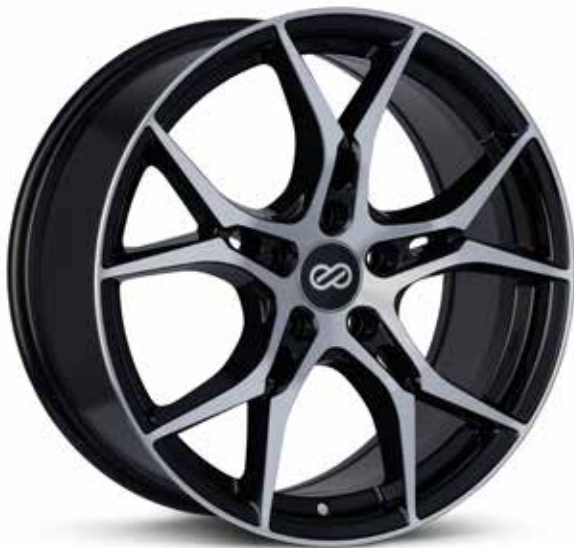
Black Machined (BKM)