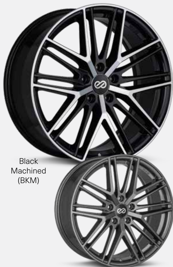
Black Machined (BKM)