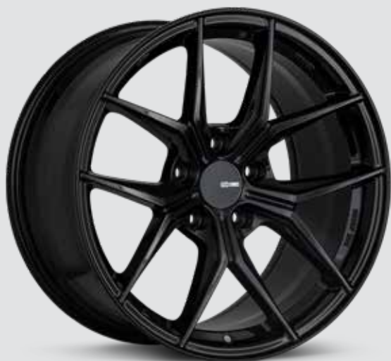
Gloss Black (BK)

Cap# A476-CAPBK, Cap# for 5x120 BMW size, Cap# A476-CAPBK BMW