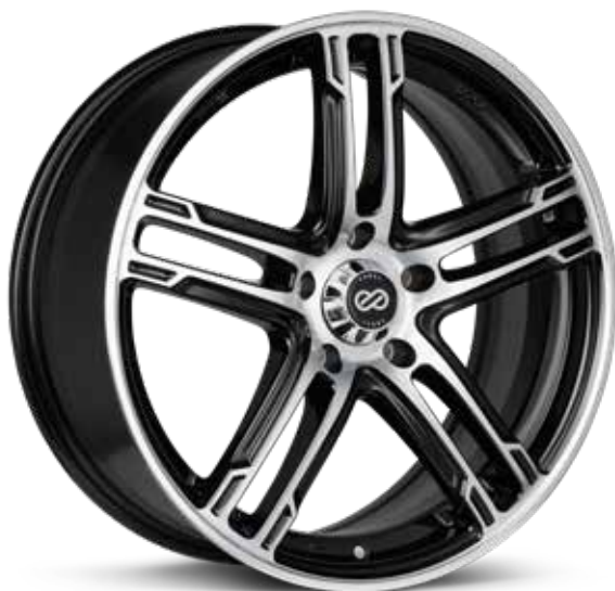
Black Machined (BKM)