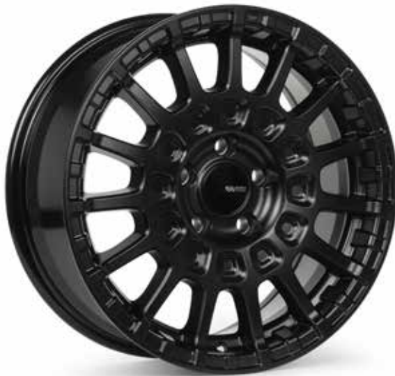
Matte Black (BK)