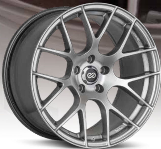
Hyper Silver (HS)