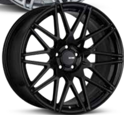
Gloss Black (BK)