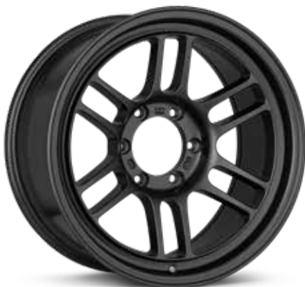
Matte Dark Gunmetal (GM)