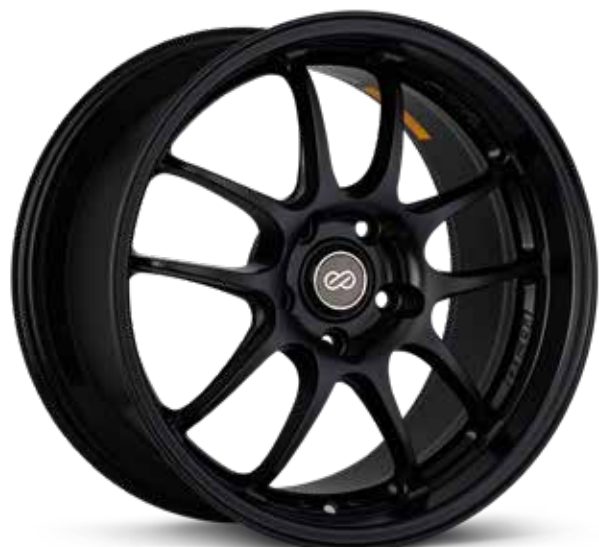
Matte Black (BK)

From time attack to drifting, the PF01EVO wheel is designed to maximize the performance of 17 and 18-inch tires, which are popular among these circuit racers fans. When mounted on a vehicle with over fenders, the minimum inset starts from 0 mm, widening the settable tread width range.