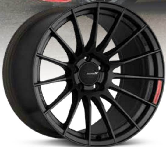
Matte Gunmetal (GM)

Designed to look incredible while retaining Enkei's racing spirit & functionality. The light weight RS05RR is made using Enkei's MAT-DURA flow forming method. With the RS05RR, there's no need to choose between form or function, you can simply have both. Made in 18x8.5-18x11 with 3 different concave face designs. Available in a Matte Gunmetal finish.