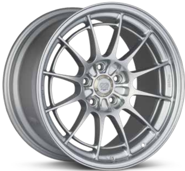
F1 Silver (SP)