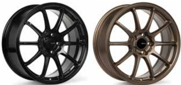
Gloss Black (BK)