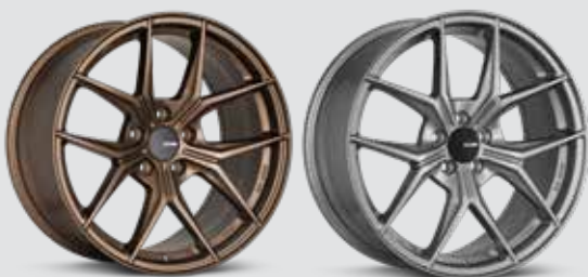
Gloss Bronze (ZP)