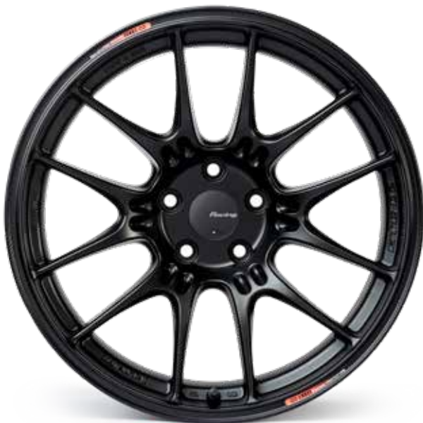
Matte Black (BK)

Visit Enkei.com for cap part numbers Each GTC02 includes two Racing Prototype stickers Valve Stem# V429-0000SP for Hyper Silver, V429-0000BK for Black