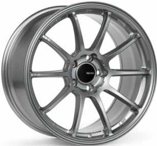
Storm Gray (GR)