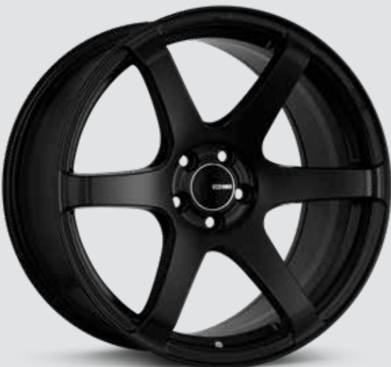
Matte Black (BK)