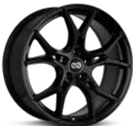
Gloss Black (BK)