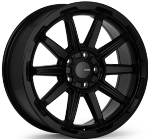
Semi Matte Black (BK)