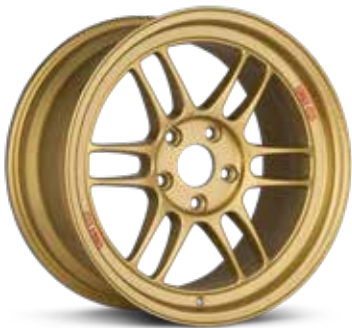
Gold (GG) (Limited Sizes)