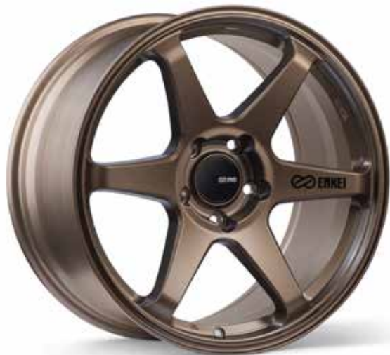
Matte Bronze (ZP)