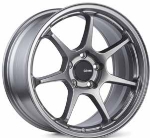
Storm Gray (SP)