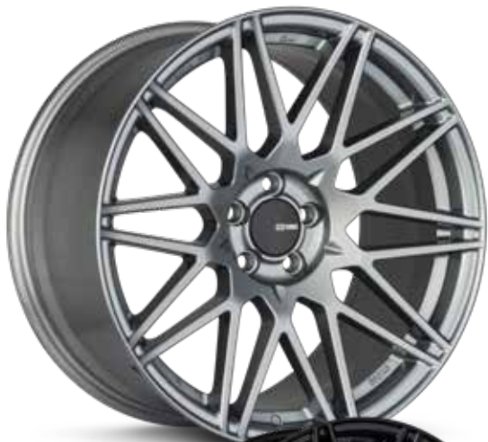
Storm Gray (GR)