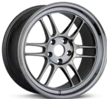
SBC (Limited Sizes)