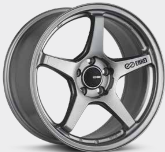
Storm Gray (GR)

The lightweight Enkei TS-5 is sure to be an instant classic in the tuning world. The TS-5 is the wheel that will have everyone admiring it at a loss for words because it just does everything right. It is remarkably simple and clean, relying on the tried and true 5-spokes and a lip formula, but the TS-5 gets the aesthetics just right. It is the golden ratio in wheel form. It screams motorsports and whispers class at the same time. It is just as much at home on track as it is on the street. With 17" and 18" sizing and widths up to 9.5", the TS-5 will suit a remarkable variety of sport sedans and coupes.