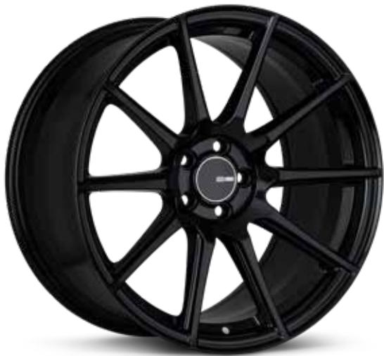
Gloss Black (BK)