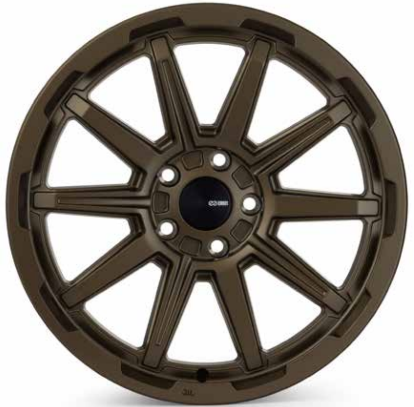
Matte Bronze (ZP)