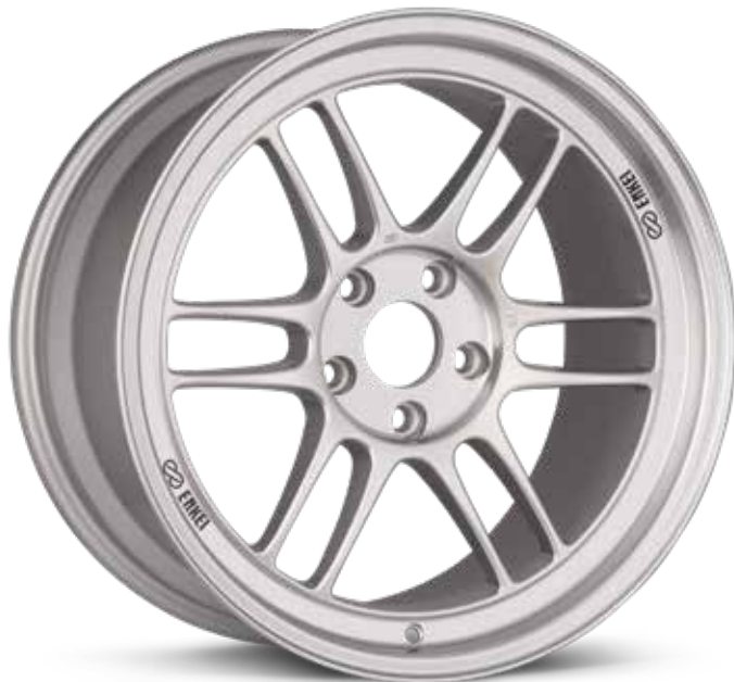
F1 Silver (SP)