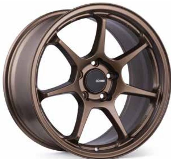
Matte Bronze (ZP)