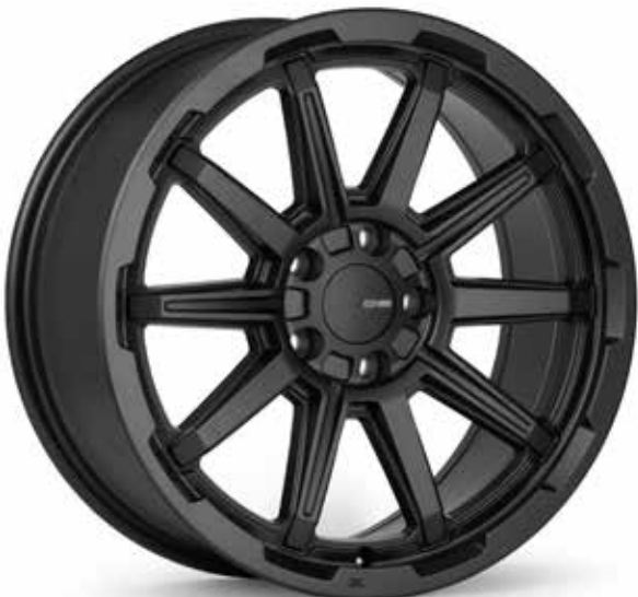
Semi Matte Gunmetal (GM -Special Order)