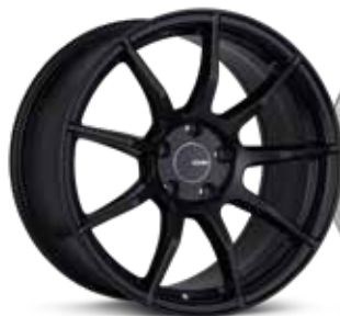
Matte Black (BK)