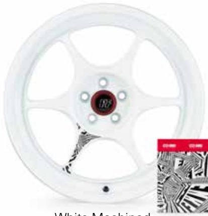
White Machined (shown with optional included decal)