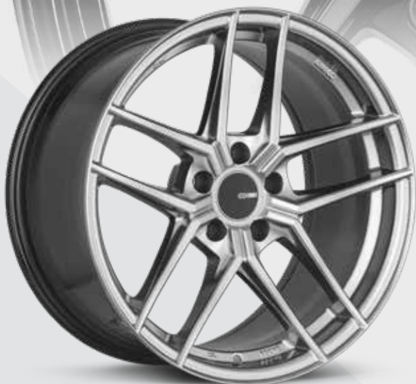
Hyper Silver (HS)

The Enkei TY-5 is an exciting entry in Enkei's lightweight Tuning series. Utilizing a sleek combination of a split 5-spoke style with the center styling cues of a mesh wheel, the TY-5 is a great choice for a wide variety of wheels ranging from small sports coupes to full-size luxury cars. It is available in several exciting colors including hyper black, gloss black, and an all-new limited pearl black. The TY-5 is available in concave and flat face profiles dependent on size and width, and includes Enkei's signature flat center cap.