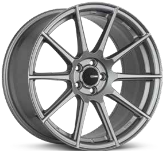
Storm Gray (GR)