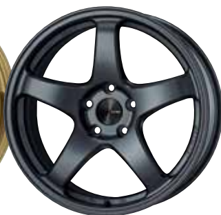
Matte Gunmetal (Special Order)