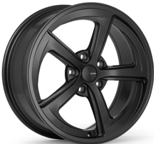
Gloss Light Gunmetal (GM)

Introducing Enkei's Performance Series. The Enkei performance series represents the absolute best combination of styling, performance, and value in the aftermarket wheel business today. Enkei's expert engineering and world-class manufacturing allow us to offer high quality wheels in a wide range of vehicle applications without breaking the bank.