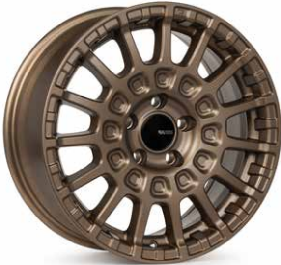
Matte Bronze (ZP)